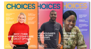
Download the latest edition of Choices

If you would like to continue the conversation at home with your child, here are some question ideas: